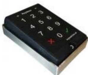
Key Pad on/off