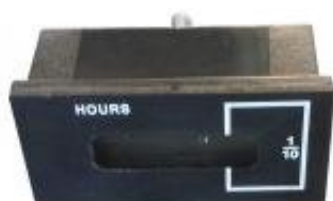
Assembled hour meter